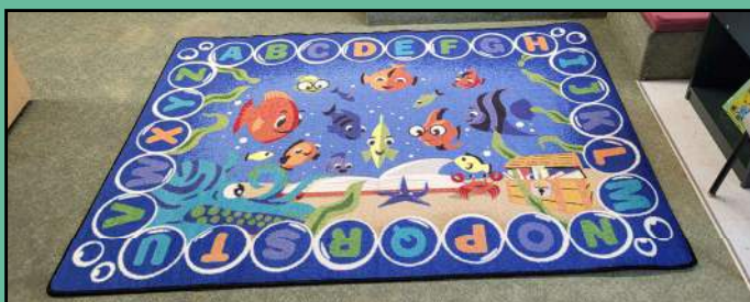
A $500 donation from the Holy Cross Anglican Church was used to purchase a new rug for the children's section at Lillian B. Benham Library in Lockeport.

The Friends of the Lockeport Library plant and bake sale raised $752.60 and was attended by close to 100 people.