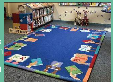
The Estate of the late Blanche Turner funded the purchase of a bright, colourful rug for the children's section at McKay Memorial Library in Shelburne.

Evacuees from Barrington Lake wildfire used the Yarmouth library, including its free Wi-Fi to gain access to the NASA fire map app.