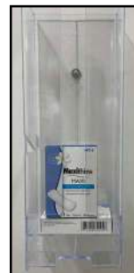
Menstrual product dispenser.

The initiative is funded by the Nova Scotia provincial