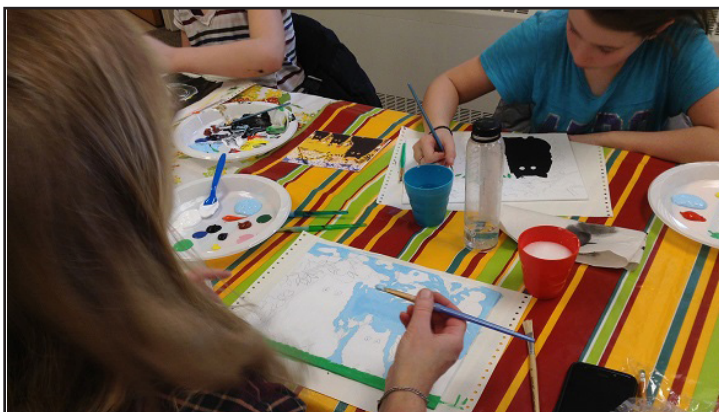
Painting A La Maud was one of the popular programs at the Digby library celebrating Heritage Day in Nova Scotia.