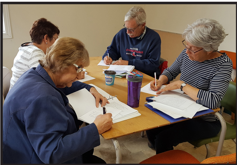
A writing workshop inspired local writers to record their memories in print at the Clare library.

The library partnered with the Réseau Santé to offer health related programming on such topics as sleep apnea and Lyme disease.