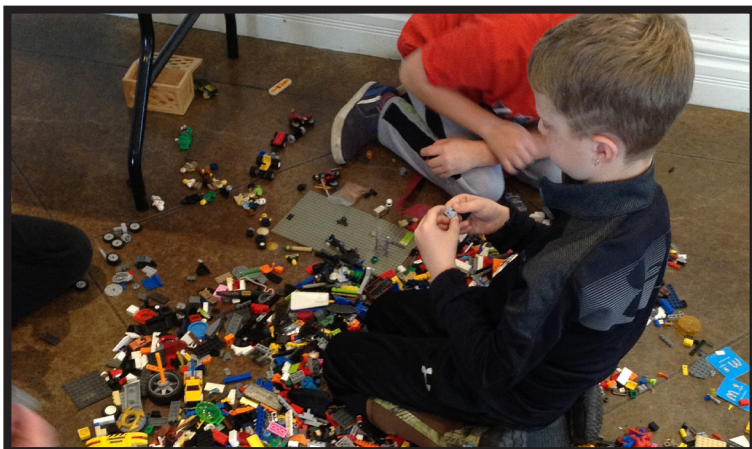
Having fun with LEGO at Weymouth library.

The library's annual Halloween bash on Oct. 25 drew a huge crowd of young people, including youth volunteers.