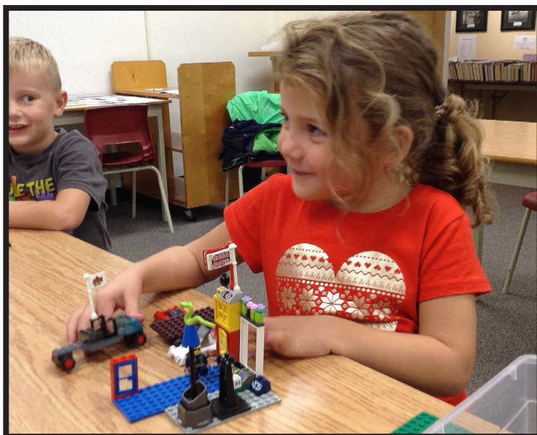
Lots of youngsters experienced the joys of building during Digby library's LEGO Fun Nights.

Makerspace drop-in programs introduced children to science-based learning activities.