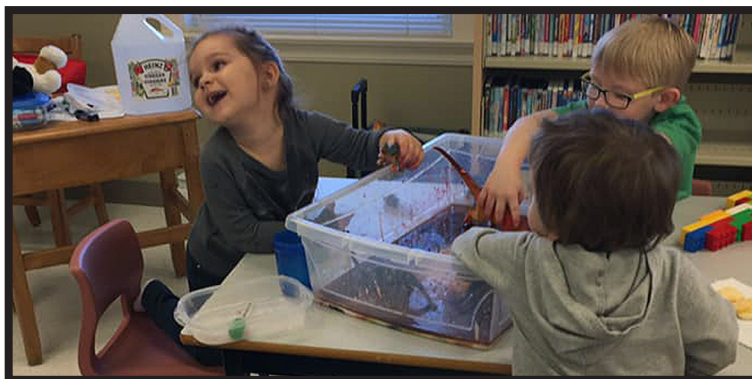
Children get creative during Tot-N-Tumble at Clark's Harbour library.

The library offered seasonal programs for children featuring crafts.