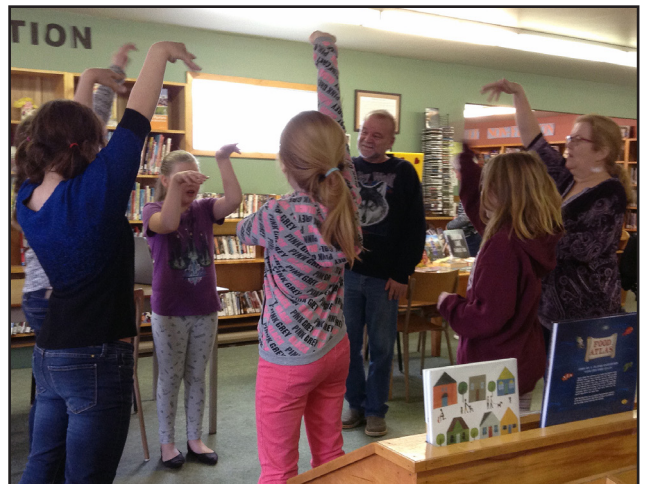
Lockeport library's theatre workshop was a hit with local youth.