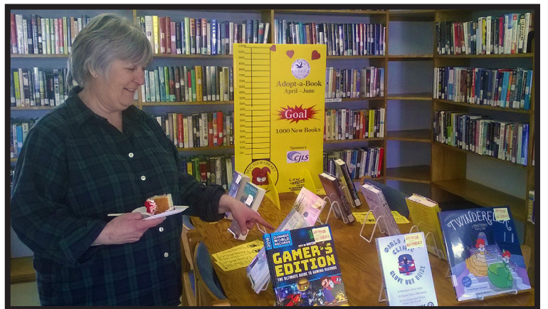
Enjoying a piece of cake at the 2018 Adopt-A-Book campaign launch at Westport library.

The library's partnership with The Family Centre, Digby Site, continued to provide seasonal family programming on topics such as pumpkin and sunflower seed planting.