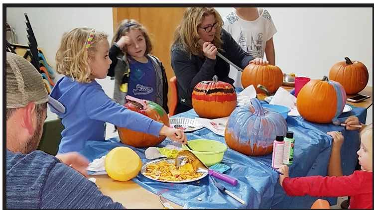
Pumpkin carving fun during Madame Citrouille.

Stories were shared through the Raconte Moi program at schools in West Pubnico, Belleville and Wedgeport.