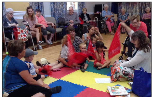
Participants enjoy the intergenerational summer edition of Story Time at Bayside Home in Barrington.