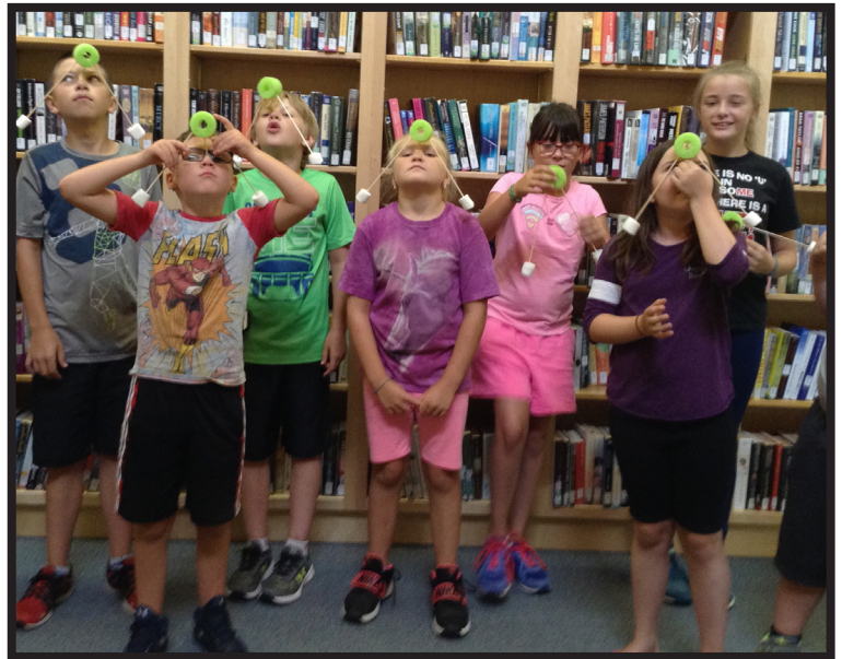
Participants in the SuperNOVA Science Camp learn about designing and balance at the Shelburne library.

The Friends of the Library continue to raise thousands of dollars for the library.