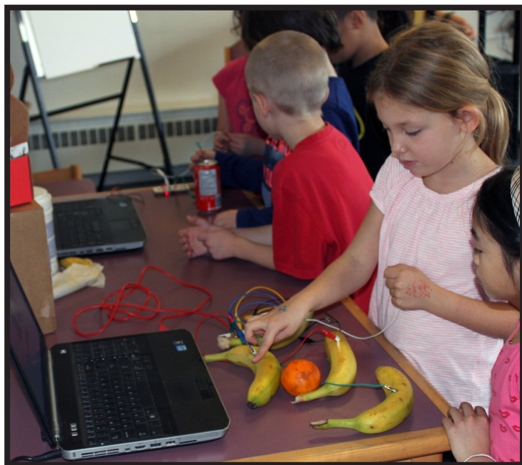
Elementary school students have fun with Makey-Makey kits during a visit to Yarmouth library.