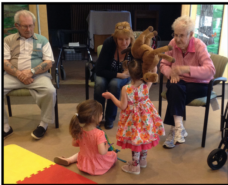
Digby library started an intergenerational story time program at Tideview Terrace.

New chairs, a baby changing station, and light-cancelling shades were part of the improvements at the Digby library.