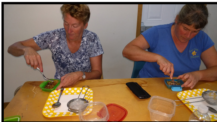
Making honey in Pubnico as part of a beekeeping program.

With the aid of community volunteers, a French story time Ansi Font Font was introduced to preschoolers and their families for a book-related, fun-filled time. Participants honed their pre-literacy skills in French.