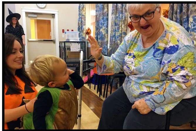
Some intergenerational fun at Bay Side Home.

The heritage of our fishing community was celebrated during the South Shore Lobster Crawl, as the library became a destination to create lobster crafts.