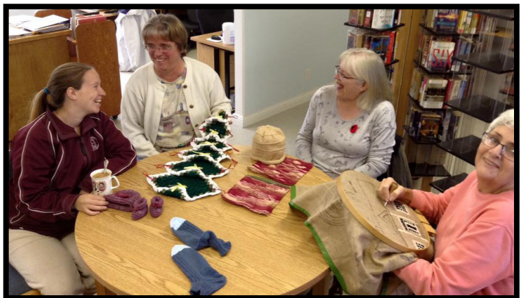
The Fibre Group members enjoy their time at the Westport library.

Area artists were invited to talk about their work and to also help people discover their own inner artist and create their own masterpieces.