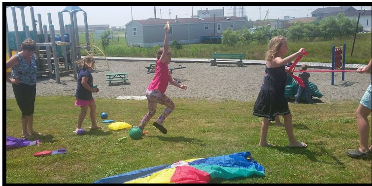
Children enjoyed playing with the Be-Fit Kits at Clark's Harbour library.

The library partnered with Kings Street Family Resource Centre to run a monthly preschool program.