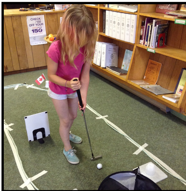
Mini-golf was part of the summer programming at Lockeport library.

Visiting international students demonstrated the art of Japanese origami and answered questions about their homeland and their experiences while studying in Lockeport.