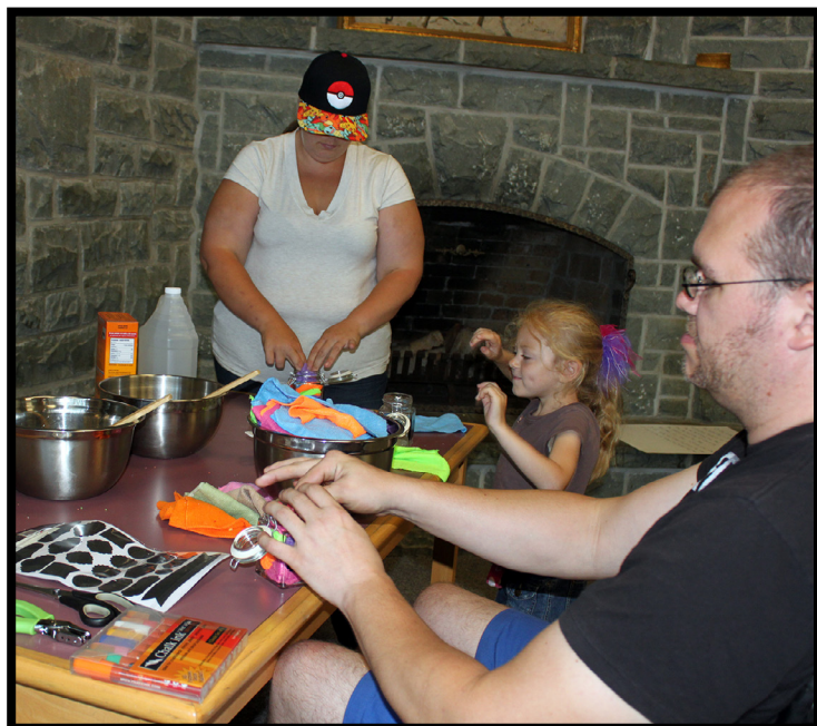
Participants make their own dryer sheets and other environmentally friendly items at Yarmouth library.

SHYFT 13 local seniors residences Yarmouth Correctional Facility Burridge Campus, NSCC NSCC Health Fair