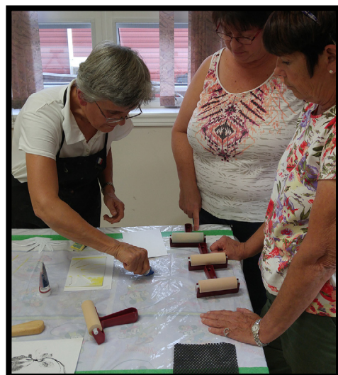
Enjoying a printmaking workshop in September at the Clare library.

Through a partnership with YREACH (a program providing support to immigrants and temporary foreign workers), fish plant workers from Riverside International Lobster were given library orientation, and Spanish language materials were introduced into the permanent collection.