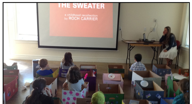
Fun at the drive-in at Weymouth library during the Summer Reading Club.