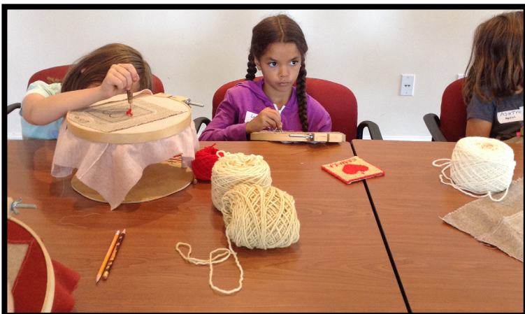
Children enjoyed Weymouth's rug hooking program.