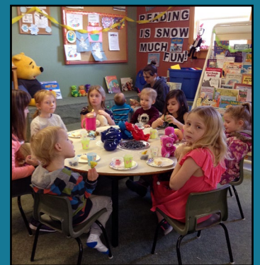
Participants sit down to enjoy the Family Literacy Day Teddy Bear Tea Party at the Lockeport library on Jan. 26.