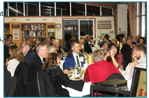
People attending the 2017 Dining Among the Stacks enjoy a laugh and a nice meal.

The Western Counties Regional Library Board recognizes the value of keeping libraries open and as such, is working to grow the Literacy Legacy Fund so that libraries can remain accessible to all in the future, she says.