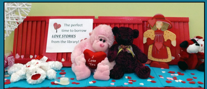
Weymouth library got into the Valentine's Day spirit with this display.